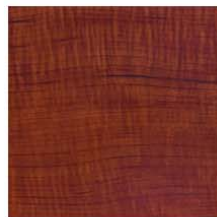
ADC American Dark Cherry