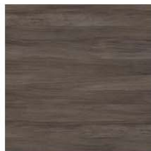
AGL Artisan Grey