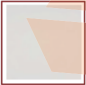
Gray with Charcoal Legs Stock