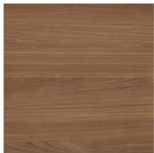
AWL Autumn Walnut