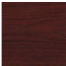
AML American Mahogany