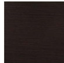
AEL American Espresso