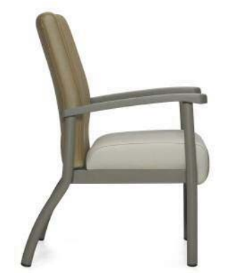
Low Back Armchair, Frame and urethane armcaps shown in Toast (TOA).