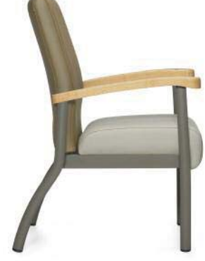
Low Back Armchair, Frame shown in Toast (TOA), hardwood armcaps in Maple (AVM).