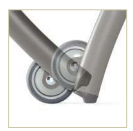
Selected patient rooms seating is equipped with mobility casters so staff can easily relocate seating units without lifting.