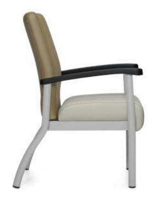
Low Back Armchair, Frame shown in Tungsten (TUN). Urethane armcaps shown in Black (BLK).