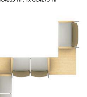
Hospital Chairs Layout G 1x GC4232, 1x GC4232R, 1x GC4241L, 1x GC4277-HP, 1x GC4282-HP