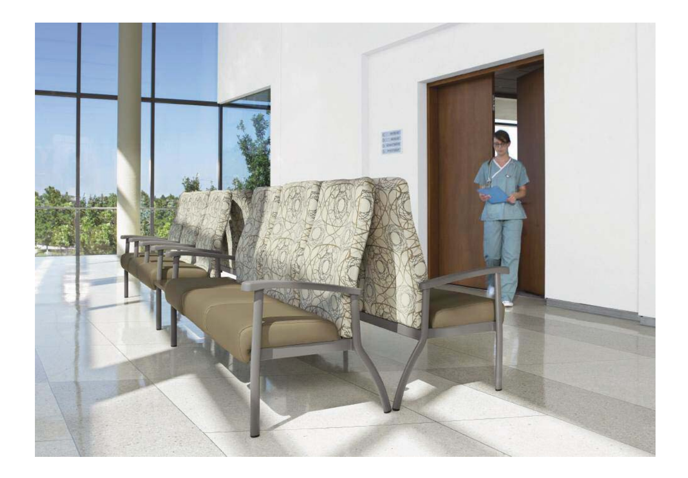
Hospital Waiting Room Furniture Frame Finishes