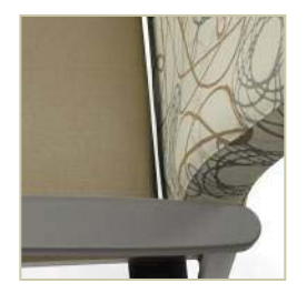
Easy clean out design supports housekeeping & infection control routines

Non marking polyethylene glides are standard on all models