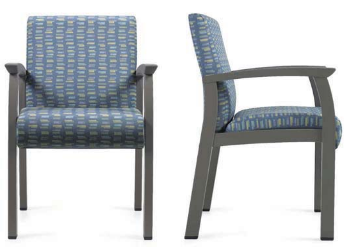
GC3631 Patient Mid Back Medical Chairs with open arms and SSU armcaps

Primacare HT is the "steel frame" version of the highly successful Primacare Medical Chairs series. Primacare HT delivers the superior strength required in high traffic (HT) environments and visually coordinates with the original Primacare wood series to provide a comprehensive 'one spec' solution.