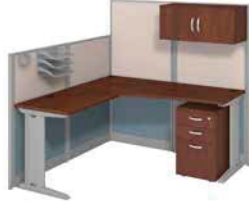
65" x 65" L-Workstation WCXX94-03K