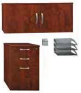
Storage/Accessory Kit WCXX90-03