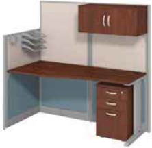
65" x 33" Straight Workstation WCXX92-03K