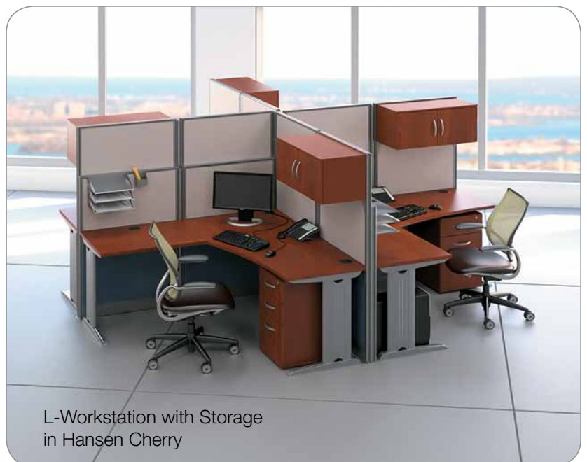
L-Workstation with Storage in Hansen Cherry