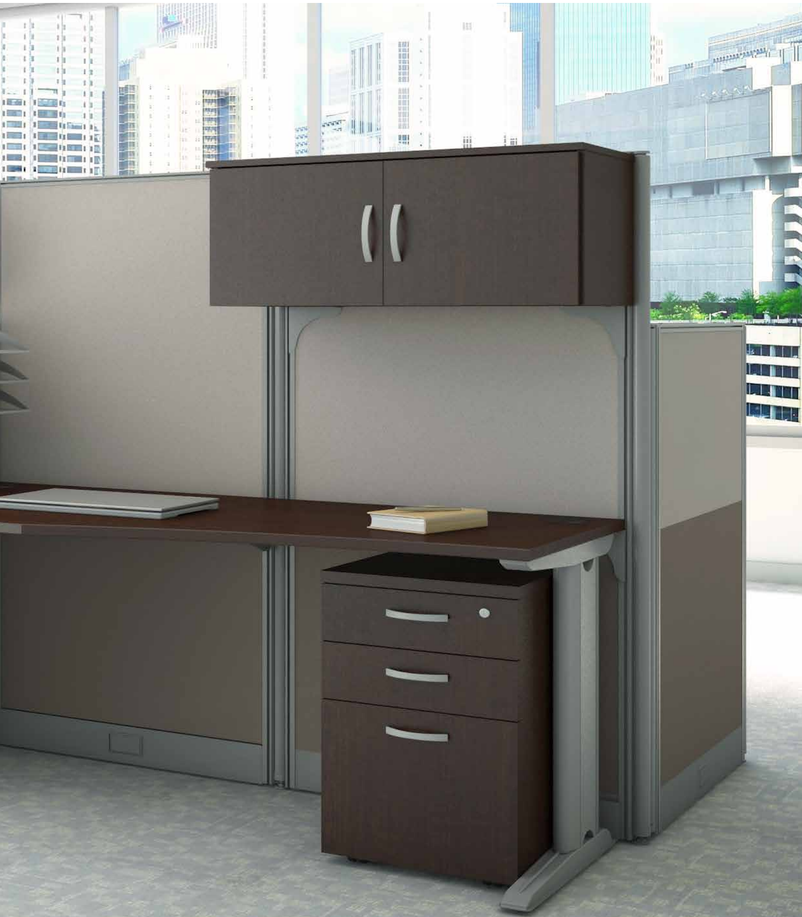
Straight Workstation with Storage in Mocha Cherry