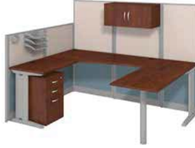
89" x 65" U-Workstation WCXX96-03K