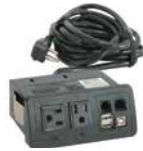
Data/Power HUB AC99840-03