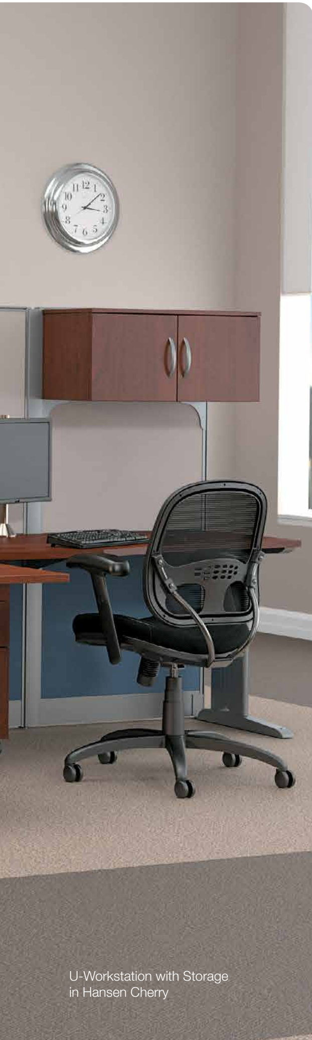
U-Workstation with Storage in Hansen Cherry